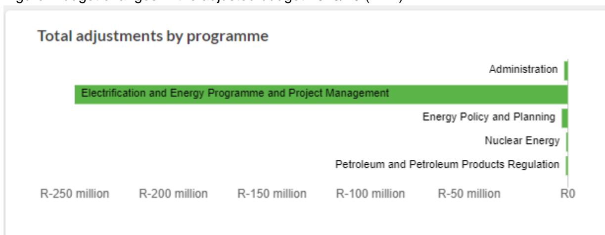
Figure: Budget changes in the adjusted budget 2019/20 (ZAR)