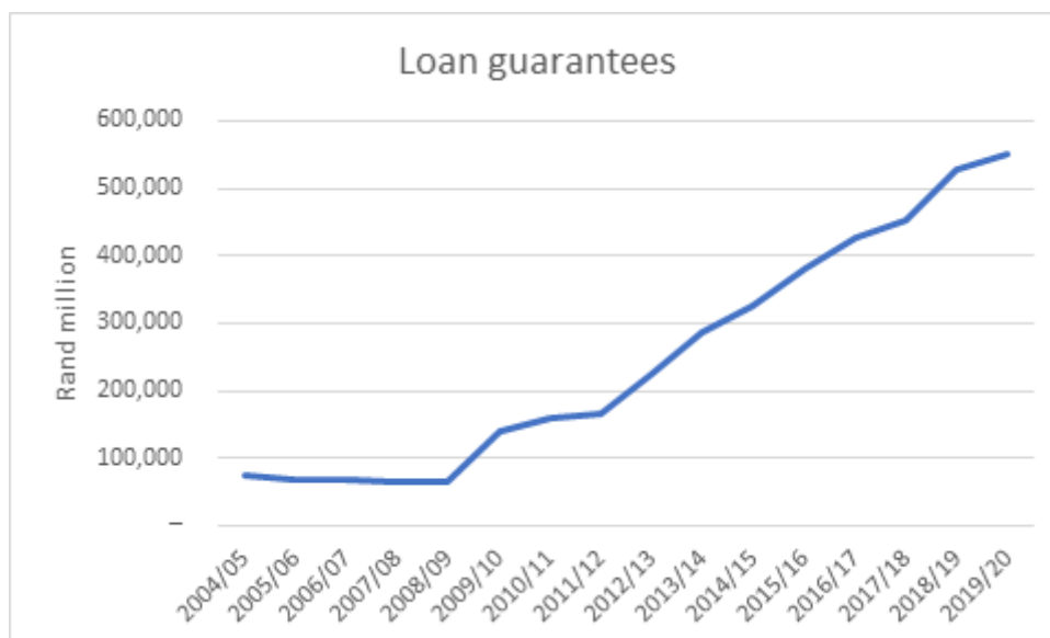
Table 11: Net loan debt, provisions and contingent liabilities

What is particularly worrying is that contingent liabilities arising out of loan guarantees to State Owned Entities have grown drastically and so too has a trend of contingent liability risks realizing in requests for bail outs. In 2019/20, loan guarantees that Treasury has provided stand at R552 billion.